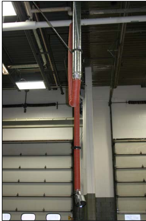
New vehicle exhaust removal equipment