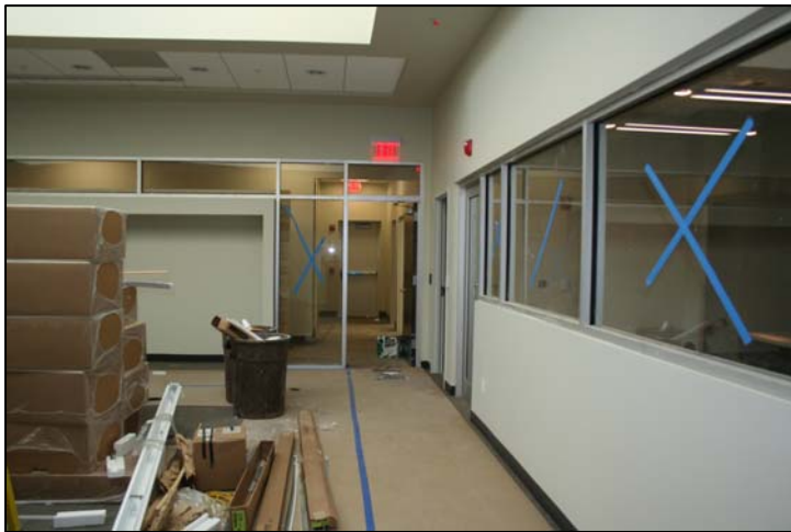
Almost finished Command Room