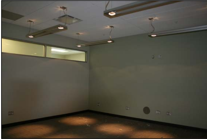
Break Out Room