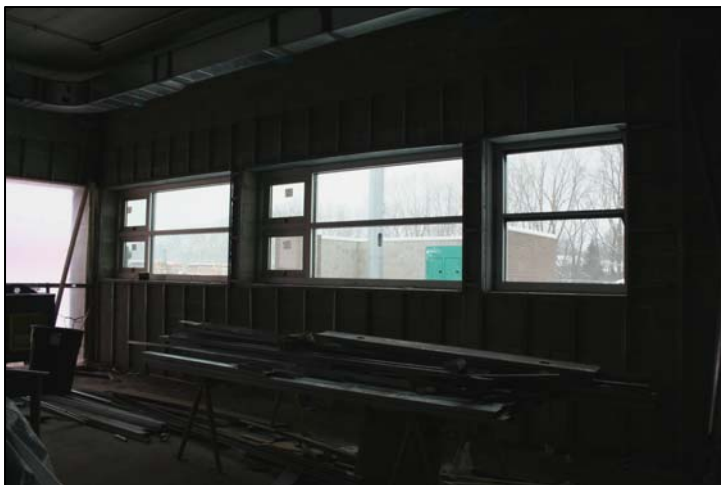
North facing windows in the Day Room