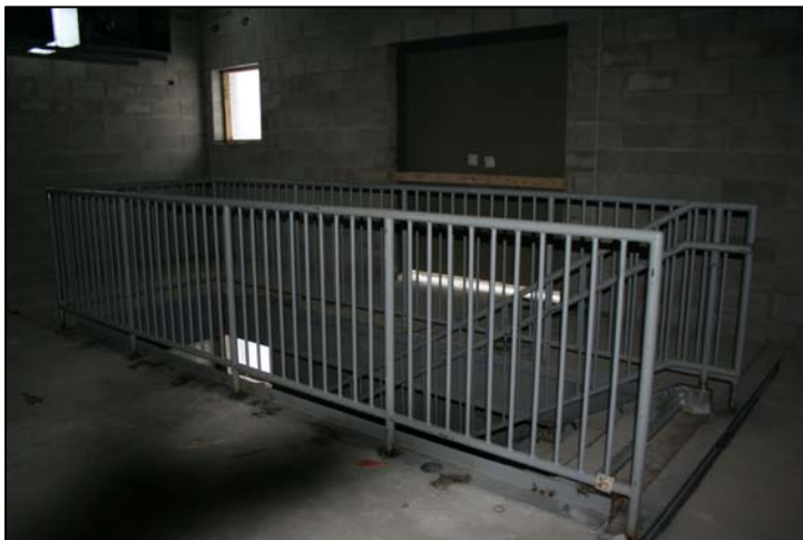
Completed railings in the hose/training tower