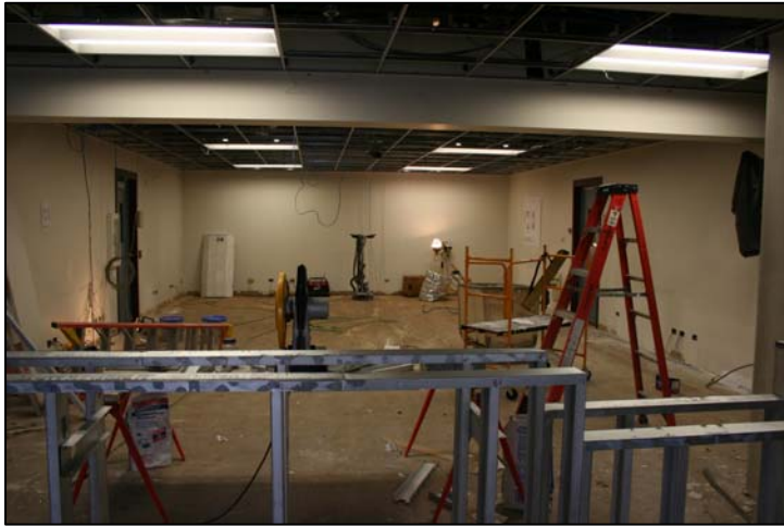
Remodeling work in the lobby and front office space