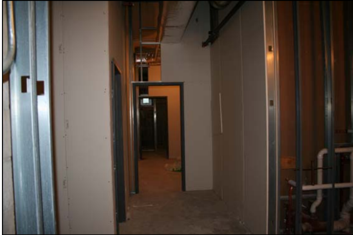
Drywall progress on the first floor