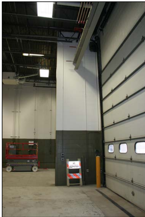
Wing wall in the old wash bay